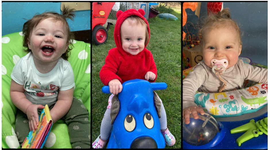
Plainwell Early Head Start Students Having a Blast!